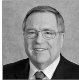
Don Atchison Mayor of Saskatoon