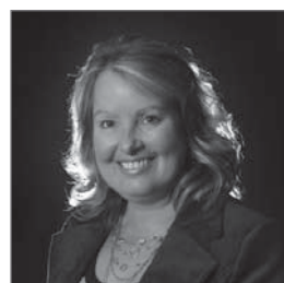
Sheryl Spence Mayor of Warman