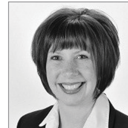
Ann Iwanchuk Ward 3 City Councillor